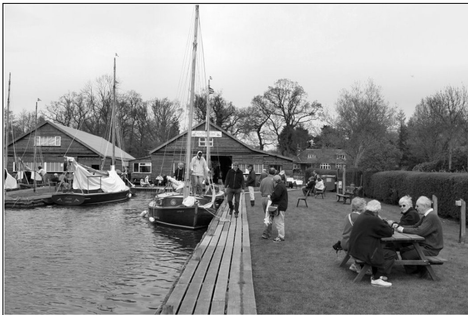
Preparing to sail