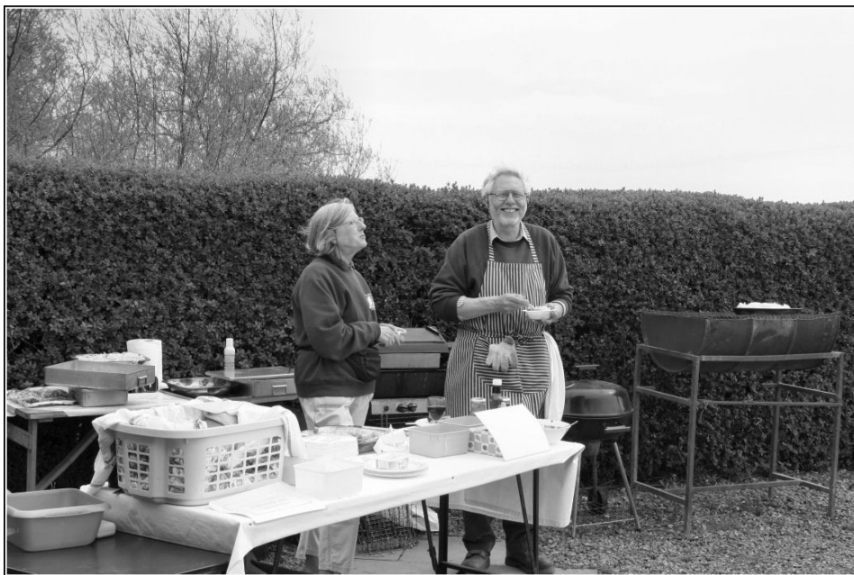
Too many chefs...?